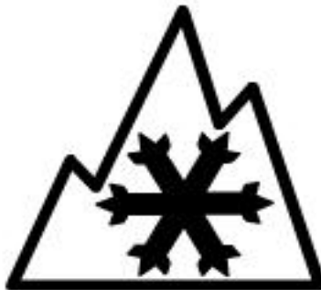
Severe winter traction icon

NOTE: Some newer tires are designed for use in severe snow conditions and are marked on at least one sidewall with the letters "M" and "S" (e.g., MS, M/S, M&S, M+S, etc.) plus have a pictograph of a mountain with a snowflake. If you need more information on tires designed for severe snow conditions contact the CTQP Administrator (at (810) 677-5745) or refer to Rubber Manufacturers Association, Tire Information Service Bulletin, Volume 37, Number 2, February 1999 and titled "RMA Definition for Passenger and Light Truck Tires for Use in Severe Snow Conditions." An example of the mountain/snowflake is shown below.